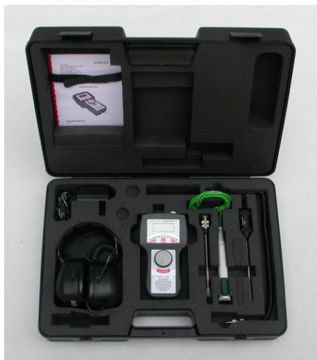
SONAPHONE K in the transportation case