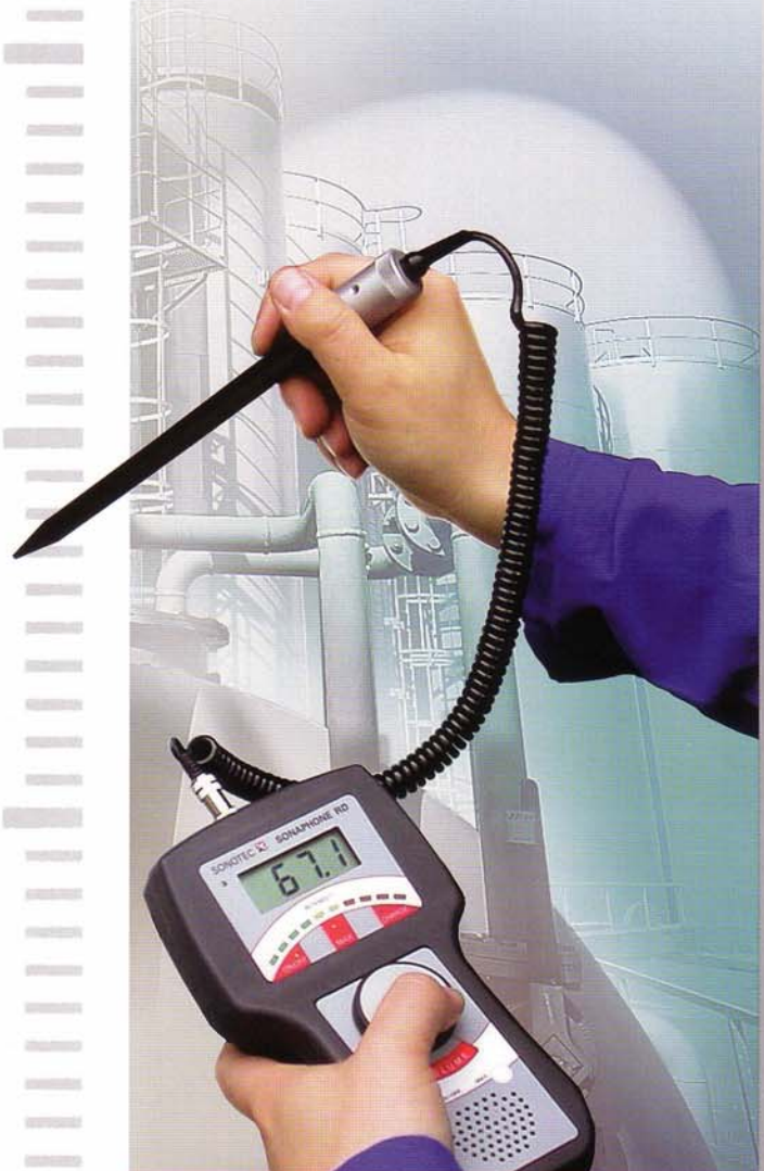
SONAPHONE RD Ultrasonic detector