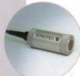
Air sound probe

This device emits ultrasonic signals. With the transmitter it is possible to test the seals in cars, vessels, doors or windows or for example, under conditions with no pressure difference. The signals are frequency-modulated to achieve a differentiation from the noise of the environment. The intensity is variable.