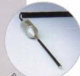
Body sound probe

Air sound probe probe is used for limited access locations, e.g. of leaks at compressed-air systems.