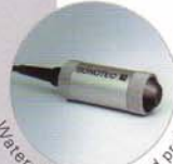
Waterproof body sound probe